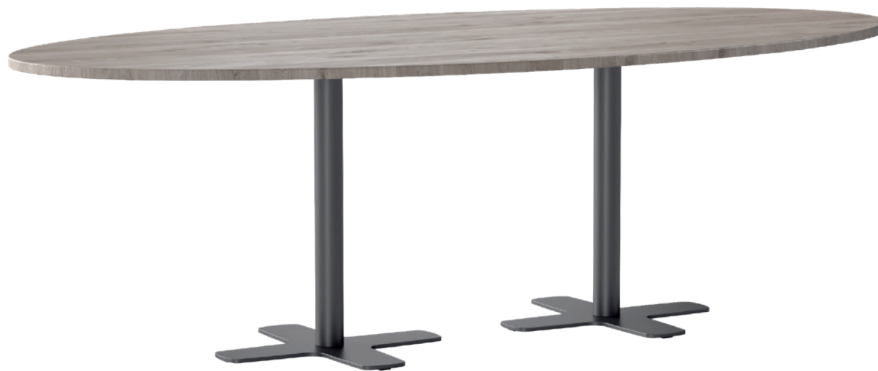
T Spinner2 ht75 2412E ep79 ...

EPOXY (ep./epa.) - HT75/90/65/40 basis/base 59x59 cm kolom/colonne diam.70mm